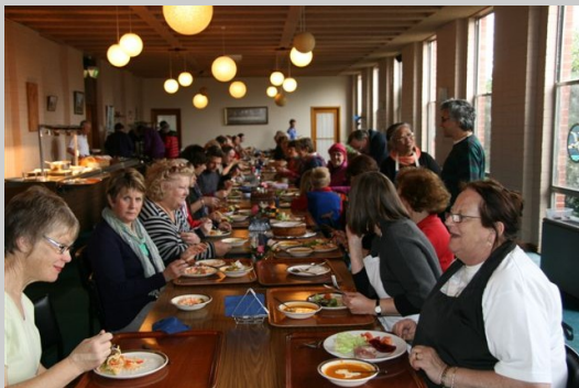
Dinner during 2011 Winter Conference

However there are subtle differences and special understandings of prophecy in each Abrahamic faith that influences the way we experience the divine challenge and our aspirations to follow God's will. Is prophecy just in the past? Can there be prophecy now? If so, what is the message today? What sort of people were prophets?